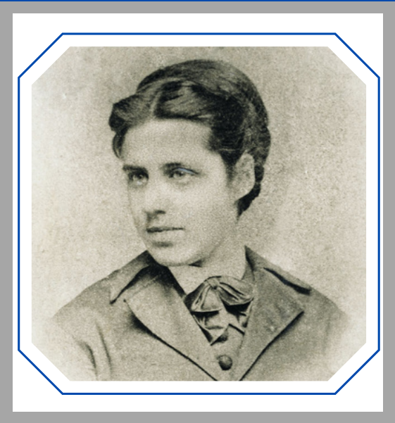
EMMA LAZARUS (1849 - 1887)

Born in New York, Emma Lazarus was an American author of poetry, prose, and translations, as well as an activist for Jewish causes.